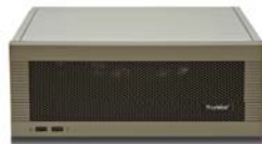
Media Xtreme Signage Player (MXS-MZ)